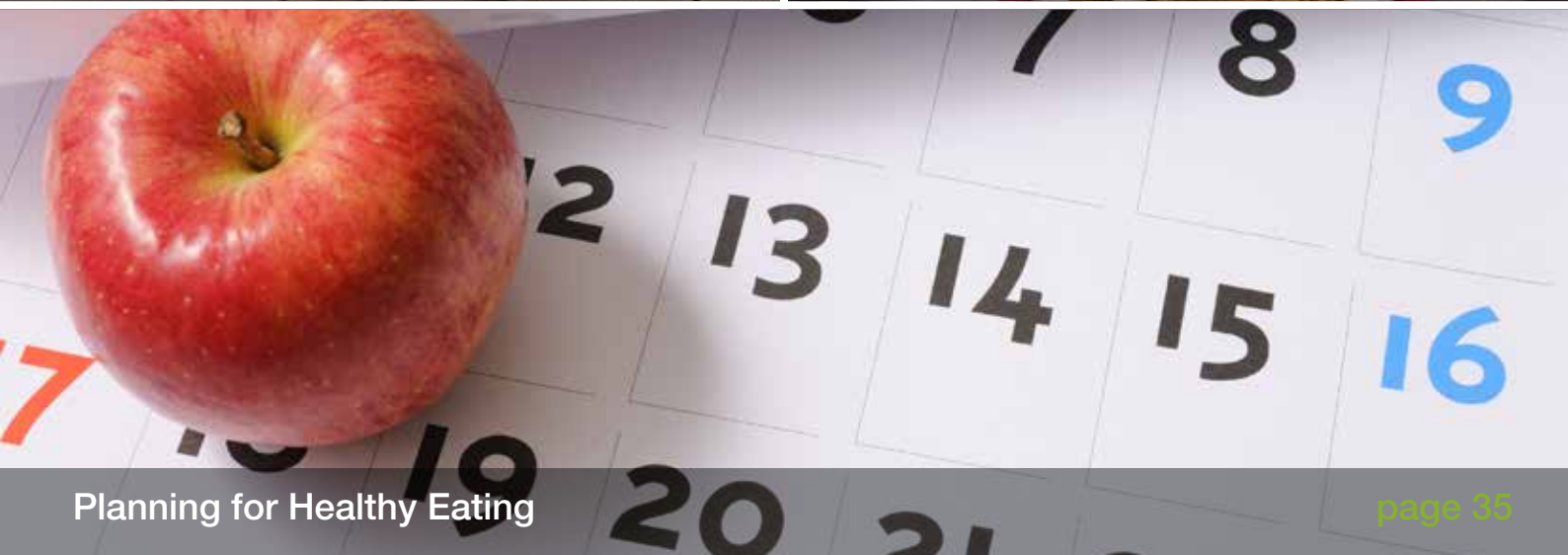
Planning for Healthy Eating