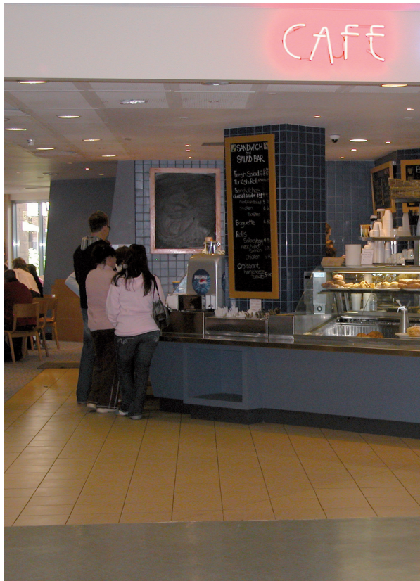
A cafe in the reception area

At any time during your stay in hospital you have the right to choose/say who may visit you. This includes your husband or wife, domestic partner (including same-sex partner), other family members or friends.