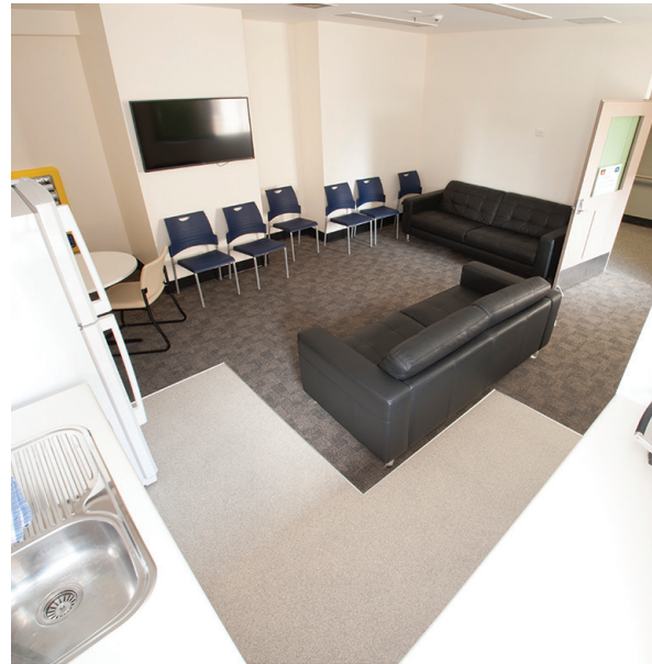
The Aboriginal and Torres Strait Islander family resource room