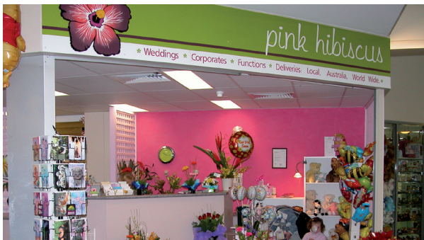
A Florist is located in the reception area

If there is a need to impose a restriction on a particular visitor this will be explained to you and your family/carers.